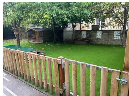
New outdoor classroom, all weather surfacing, mud kitchen, upgraded sandpit and seating area.