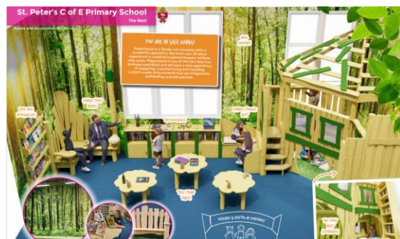
Dedicated nurture space available to all named by children as 'The Nest'.