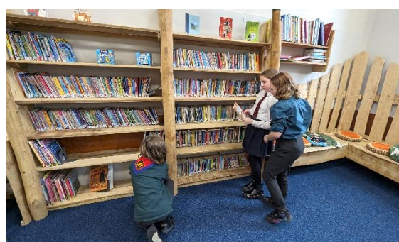
Our brand new fully re stocked library with its very own story boat.