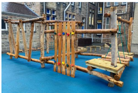
'Scramble Stax' and Parkour Equipment.