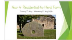
Herd Farm Parent Information Presentation