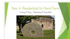
Herd Farm Parent Information Presentation