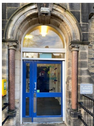
Year 5&6 to enter via these doors

Children in Year 5&6 will enter school through the main front door. All other year groups would access through the double doors leading into the hall. Parents can then exit via the gate into the car park. Staff will be in classrooms to greet children and there will also be staff on hand in the hall and corridors to help guide and supervise children to their classrooms.