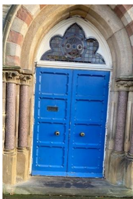
All other classes enter via these doors