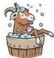
soap that goat