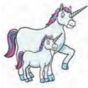
born with a horn