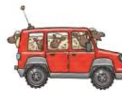
sheep in a jeep