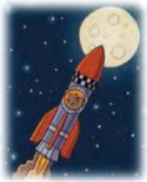
zoom to the moon

Phonemes we will be focusing on this week in school -