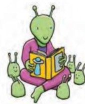
get near to hear