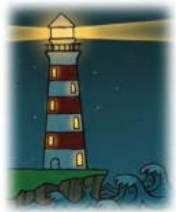
a light in the night