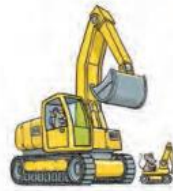
a bigger digger