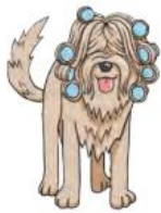
curl the fur

Phonemes we will be focusing on this week in school -