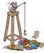
hook a book