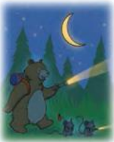
march in the dark