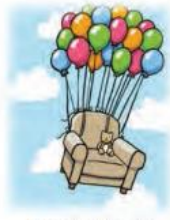
chair in the air

Phonemes we will be focusing on this week in school -