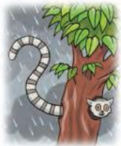
tail in the rain

Phonemes we will be focusing on this week in school -