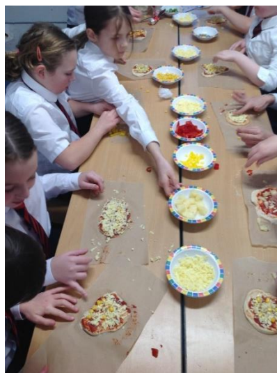
Some of the finished pizzas that were cooked at home.