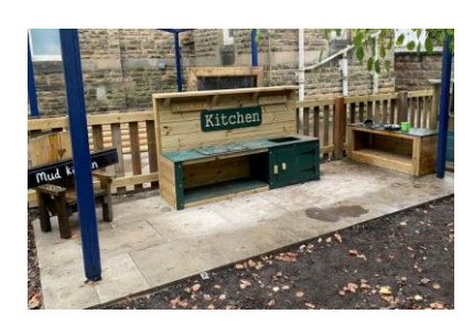
New outdoor classroom, mud kitchen, upgraded sandpit and seating area.