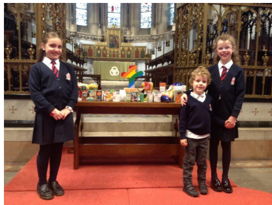
Harvest Celebrations 2023.

We were delighted to share our worship today with families and friends in St Peter's church as we celebrated our Harvest Festival. During a lovely service led by the children we took time to pause and give thanks for all those involved in growing and producing the food we eat each and every day. Thank you to everyone who attended to join us and for all the generous donations of food that will be put to good use in the weekly St Peter's Church supermarket which provides essential food items to those who need them on a no questions asked basis. This takes place every Thursday at St Peter's Church from 4.30pm. Donations can also be made throughout the year using the baskets at the front and back of church.