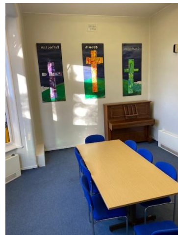
A refurbished dedicated family meeting room. A calm and peaceful space for meeting with families throughout the day.