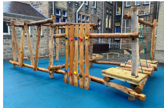
Replacement of Pirate ship with new 'Scramble Stax' and Parkour Equipment.