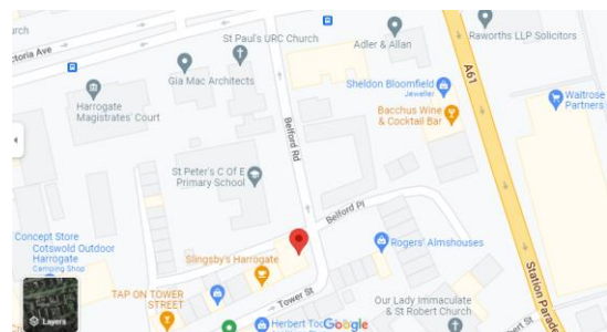
Why not come and see for yourself. Tours can be booked via the Admissions Page of our website