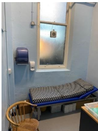
A dedicated Hygiene Suite and first aid room.