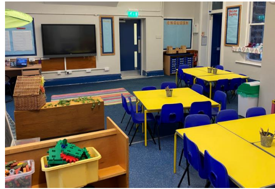
Redecoration of our second Year 1&2 classroom, new breakout space direct from the classroom and new internal secondary fire evacuation route.