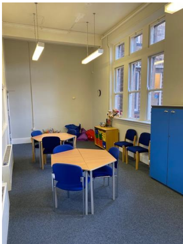
Dedicated Nurture Space named by the children 'The Nest'. This space is available to all throughout the day including lunchtime.