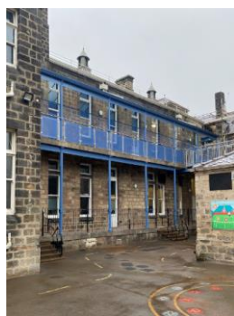
Removal of external fire escapes and complete replacement of balcony metal work.