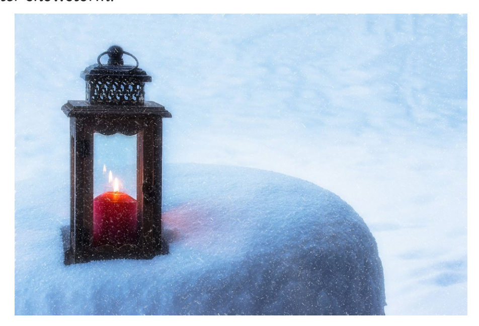
Sentence 1: Include an expanded noun phrase.

Use this picture as inspiration to carefully think and write a short paragraph about this lone candle in a winter snowstorm.