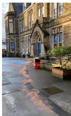
A path across the front playground will be cleared and gritted