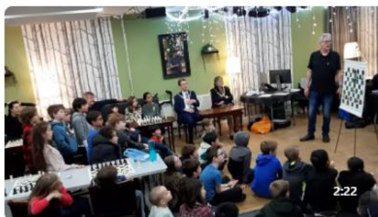
Harrogate Junior Chess Championships 2022

Oatlands won the trophy for the school with the overall best results and St Peter's took away the runner up trophy. All in all, a very successful performance to be celebrated.